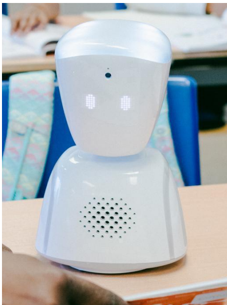
AV1 when the user is connected

When the user is online AV1 lights their eyes and head so that everyone around can see if AV1 is active or not.